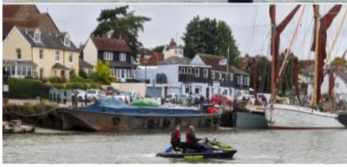
The Chelmsford & Maldon Community Policing Team spent some time in #BurnhamonCrouch this afternoon and evening. It was nice to see so many residents give us a wave 🌊